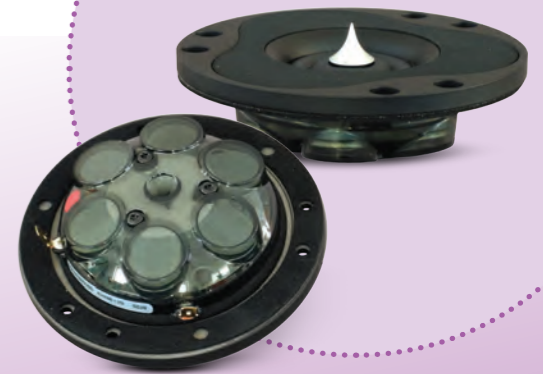
Tweeter Scan-speak Illuminator R3004 from AQ Passion