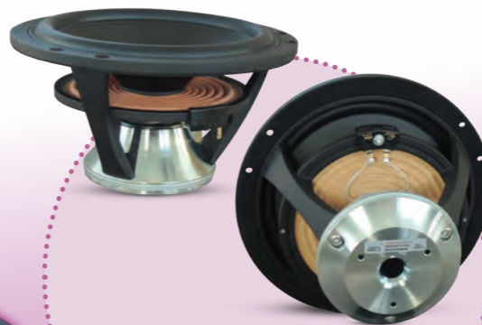
Midwoofer Scan-speak Illuminator 18WU from Passion Orca

Yet all of this would not work without a proper blood supply. In Orca the blood is delivered with superb network of arteries and the arteries in Orca Loudspeakers is exquisite Audioquest Solid Core with structure-oriented copper. The terminals combine work of art and precise engineering to allow firm and superb connection to the amplifier signal. These custom terminals feature machined polyethylene plate, solid core gold plated copper connectors allowing for bare wire, banana and spade connections. Bi-wiring and Bi-Amping is also possible. Orca depends on strong muscular tale to charter the waters. Orca Loudspeaker depends on design specific stand that allows proper support, listening height and absolutely compliments the slender beauty. To secure precise alignment a series of hidden neodymium magnets were imbedded in the enclosure and the stand. Antivibration pads reduce vibration transmission to the stand and quartet or audiophile trio of spikes further reduce transmission to the floor. Although modest in size Orca sound is astonishingly powerful and voluminous. It's a floorstanding loudspeaker in a rather diminutive enclosure.