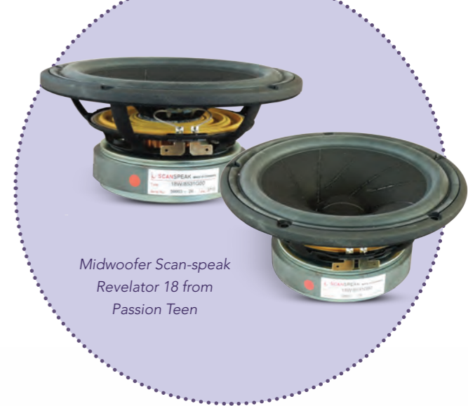
Midwoofer Scan-speak Revelator 18 from Passion Teen

The superiority of the driver's internal crossover results in a first order that has the advantage of minimal phase shift. Internal wiring is Solid Core AUDIOQUEST. Crossover components are hand selected, individually measured, matched and are point to point wired and thermally soldered. Internal wiring is soldered directly to the contacts on the transducers and terminals, eliminating the possibility of contact resistance.